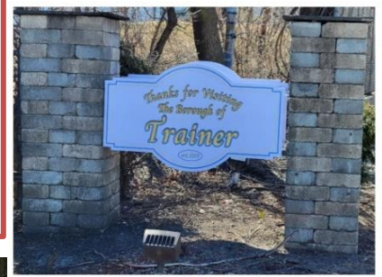
THANK YOU to Monroe Energy for our Welcome to the Borough signs. We appreciate you!

Beginning 12 am on April 1 st , Lower Chichester Fire Company 39 will assume full responsibility for fire protection services within Trainer Borough.