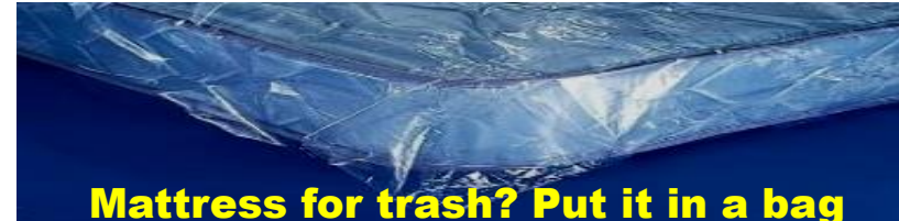
Mattress for trash? Put it in a bag

It's that time of year to test the devices and change the batteries